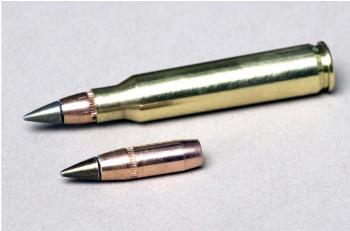
Figure 2. 5.56mm M855A1 Enhanced Performance Round, U.S. Army (2010).

The U.S. Army’s so-called “green bullet” the M855A1 Enhanced Performance Round replaces the lead core of the previous M855 bullet with copper, potentially taking around 2,000 metric tons of lead per year out of production (Woods, 2010). Consequently, harmful lead residues no longer enter ecosystems as fired rounds degrade. The shift from lead to copper required a redesign of the slug shape which allows the bullet to achieve greater accuracy and consistency of effect at increased ranges. By all accounts the M855A1 is a better bullet than its predecessor: the “green” redesign resolves the issue of environmental pollution while simultaneously making the bullet more effective at achieving its primary purpose (Calloway, 2013).