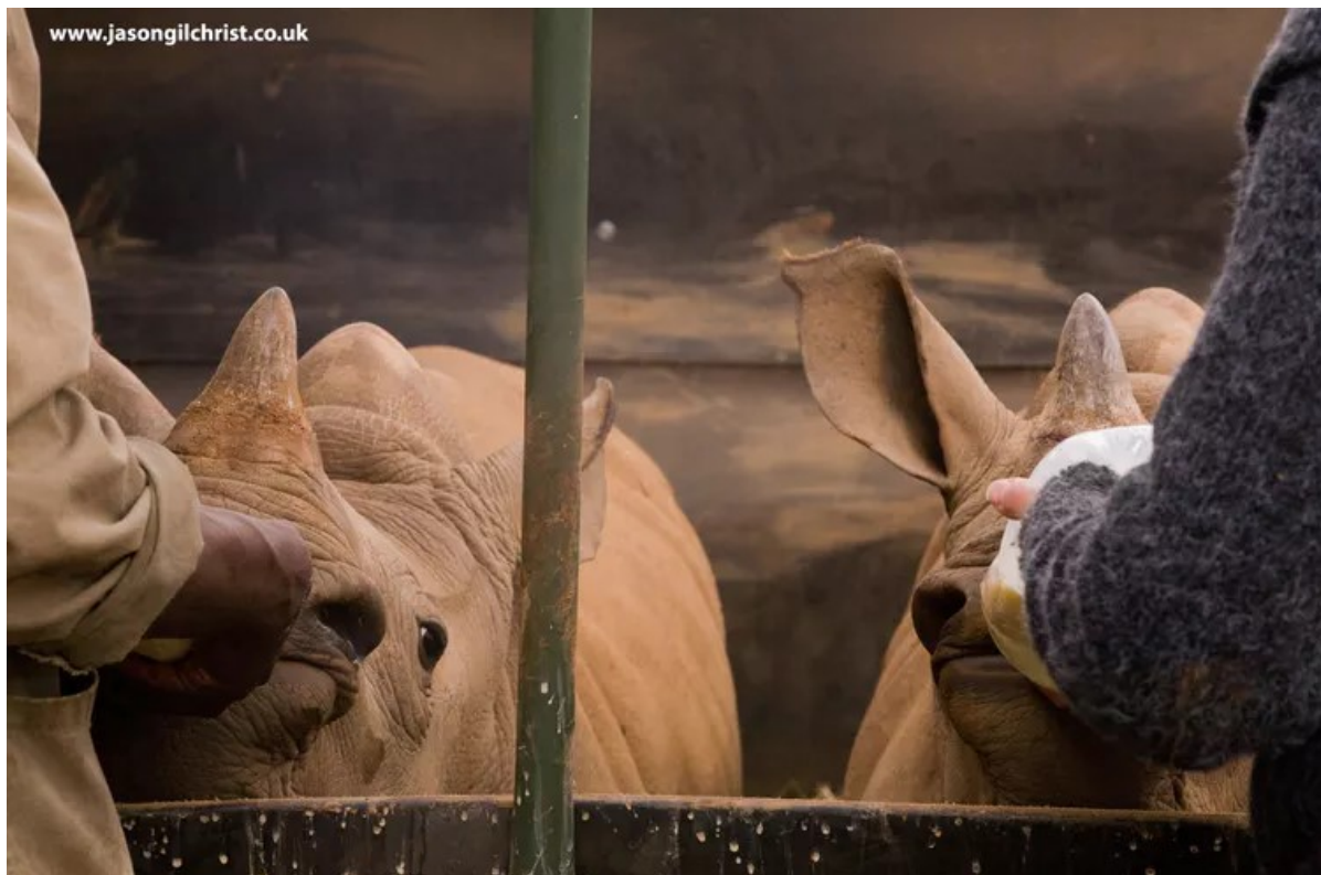
Hand rearing orphaned baby southern white rhino, South Africa.

The importance of Sudan’s actual death remains unclear, partly because it seems increasingly possible to bring his subspecies back to life. The northern white rhino may be resurrected by Jurassic Park-style technology. That would require conservationists to collect eggs from the remaining females and develop IVF techniques that are as yet unproven on rhino.