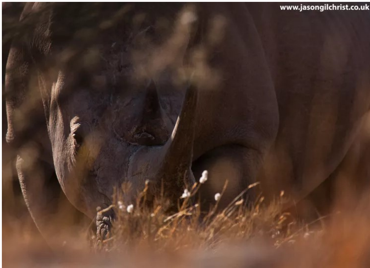
Most southern white rhino are found in South Africa where they are under sustained pressure from poaching for their horn.

The second issue, that clouds the importance of the almost certain extinction of the northern white rhino, is that the white rhino survives through its southern subspecies which may (with help) be able to replace the northern white rhino in its historical range across central Africa. In doing so, it could fill the vacant ecological niche.