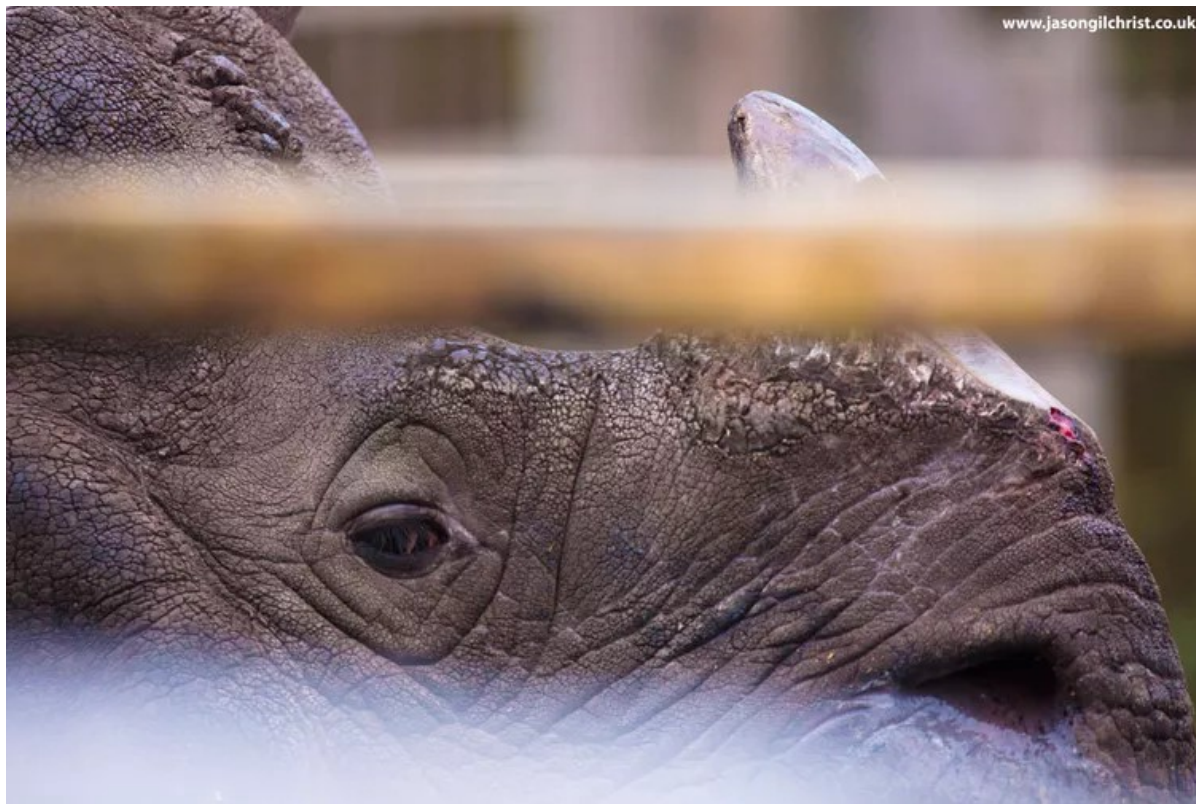
A greater one-horned rhino in a zoo. Only about 3,500 individuals remain in the wild in Asia.

It is easy to see why cutting edge reproductive technology is so appealing now that the planet's sixth mass extinction crisis is well under way.