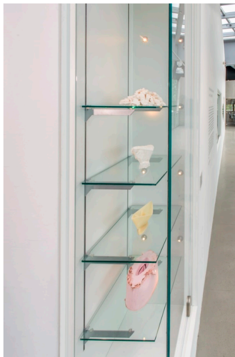
Figure 2. Material Journey (stages) , 2018: processes displayed.