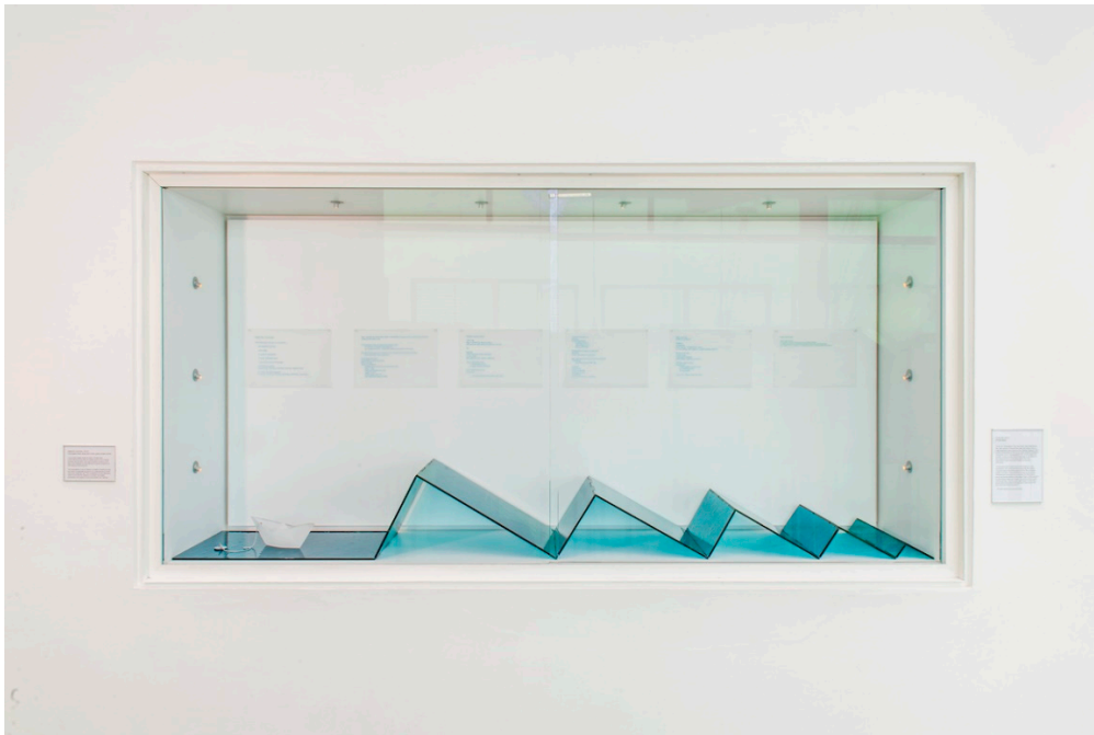
Figure 3. Material Journey , 2018—final work with a cast glass boat with a rubber plug hole atop a fused glass wave, with poem text in the background.