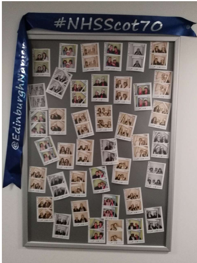
Figure 4: A selection of selfie photos take during the NHS 70 th anniversary celebrations at Edinburgh Napier University

hashtag #NHS70 and #NHSScot70 @EdinburghNapier to continue celebrating 70 years of nursing and midwifery in the NHS.