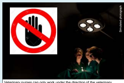
Veterinary nurses can only work under the direction of the veterinary surgeon responsible for the animal