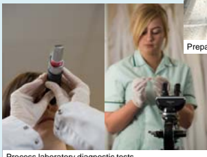
Process laboratory diagnostic tests