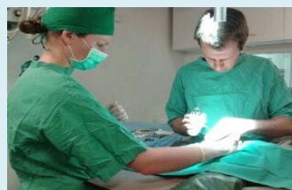
Only veterinary surgeons can perform surgery (other than minor)