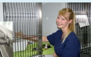
Provide dedicated peri-operative care