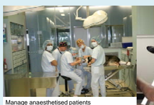
Manage anaesthetised patients