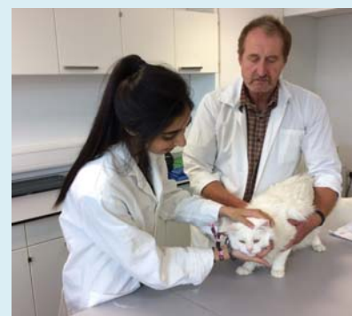
Only veterinary surgeons can diagnose diseases and injury