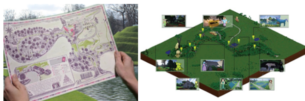
Figure 1. Jupiter Artland paper map and Minecraft map

Although Minecraft reduces visual realism it does enable the creation of geographically accurate virtual environments, with dimensions to scale, providing realistic distances, heights and depth. The world we created conforms geographically to Jupiter Artland, with works placed in the area they occupy in the real world, see figure 1.