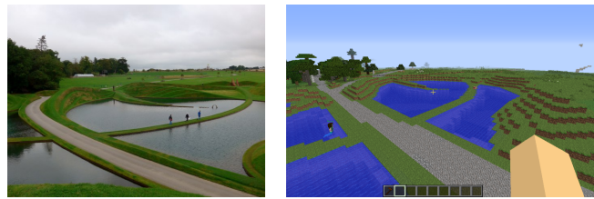
Figure 2. Cells of Life at Jupiter Artland and in Minecraft

virtual, with visitors to virtual Jupiter Artland able to use the paper map of the real in order to navigate the virtual, as in figure 1.