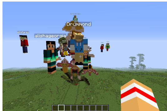
Figure 8. Teacher's view as projected in the classroom (in front of Love Bomb)

The children's avatars were collocated in the Minecraft Jupiter Artland and children were aware of each other and could cooperate. We connected a laptop for the teacher to the classroom projector and this was displayed on the class whiteboard. This meant that all the children could see the teacher's view of avatars of the entire class sharing the same virtual world. This is demonstrated in figure 8.