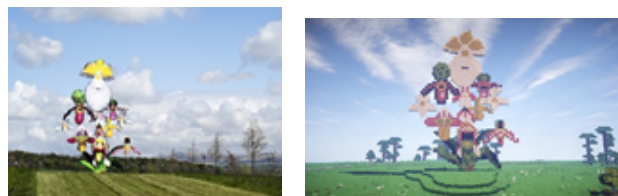
Figure 4. Love Bomb at Jupiter Artland and in Minecraft

Although some artworks were constructed manually, for many of the artworks we used 3D scans as a basis for the Minecraft construction, reducing development time. However, even when importing 3D scans, it is not possible to render objects to scale using Minecraft blocks at quality resolution. Thus, significant refinement was often required for smaller artworks. 3D scanning was found to be particularly effective for immense artworks, such as Quinn’s Love Bomb a 12-metre-high orchid see figure 4.