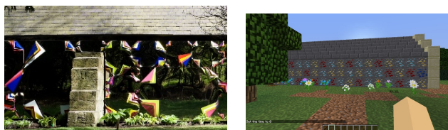
Figure 7. A Forest at Jupiter Artland and in Minecraft

Figure 6. You Imagine What You Desire at Jupiter Artland and in Minecraft Although our virtual Jupiter Artland was complete and we had successfully created Minecraft virtualisations of most of the artworks within Jupiter Artland, two works in the collection defied representation and we were unable to capture them successfully. One of these was Tania Kovats' Rivers a specially constructed boat house which contains specimens from 100 rivers across the British Isles. Building the boat house was a straight forward task. The specimens, however are stored in a collection of bottles. We were unable to represent these bottles in any convincing manner. We did initially use potion bottles, a standard Minecraft item but these were felt by the curator to be too far away from their real-world counterpart. Currently the boat house remains empty awaiting a solution. Another issue was Jim Lambie's A Forest which uses spray painted chrome, see figure 7. There is no effective way of producing an effect like this in Minecraft and although we provided a representation this completely lacked the vibrancy of the real artwork.