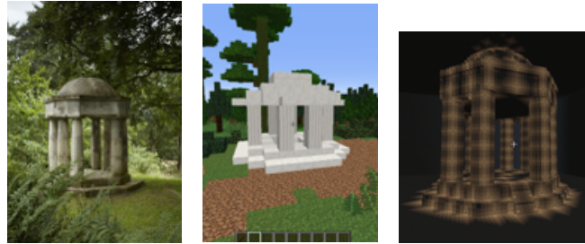
Figure 9. Temple of Apollo at Jupiter Artland, in surface Minecraft and full resolution underground version.

presented. If this representation was to scale it would be the size of the Great Dome of St. Paul's Cathedral. This approach effectively mitigated one of the major issues with trying to create accurate renditions of sculptures in Minecraft, that of resolution.